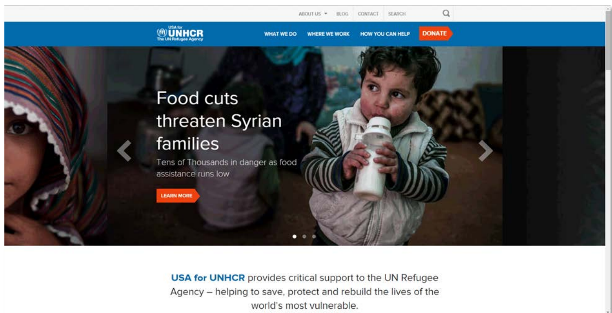
Unrefugees.org – Website View